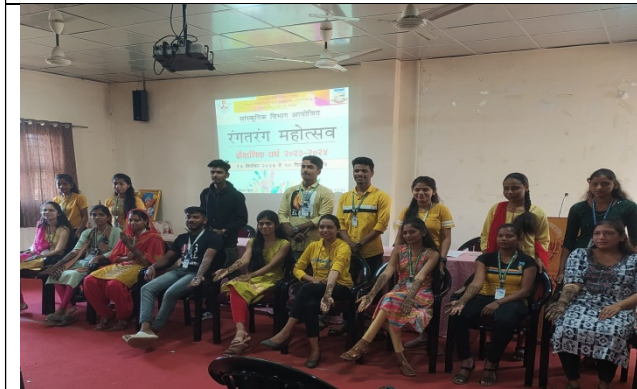
वडा, महाराष्ट्र, भारत M45W+X6C, वडा, महाराष्ट्र 421303, भारत Lat 19.66008° Long 73.145392° 22/12/23 10:46 AM GMT +05:30