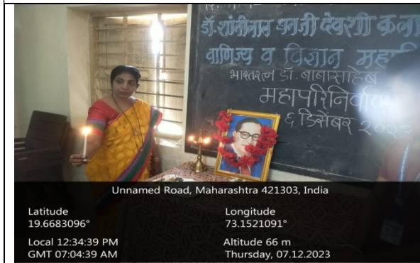
Unnamed Road, Maharashtra 421303, India Latitude 19.6683096° Longitude 73.1521091° Local 12:34:39 PM Altitude 66 m GMT 07:04:39 AM Thursday, 07.12.2023