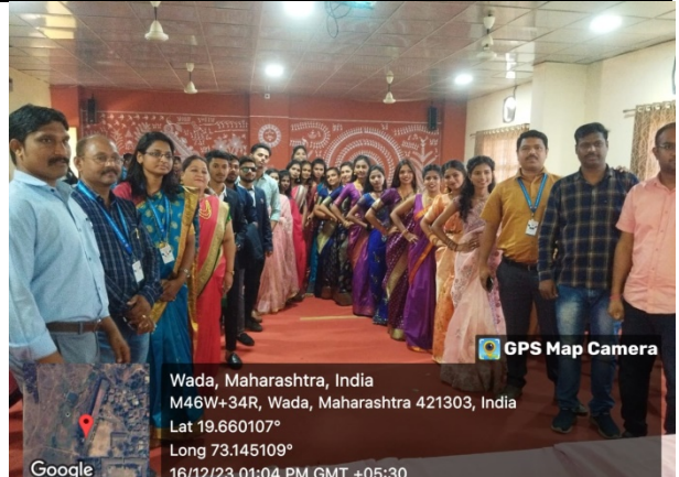
Wada, Maharashtra, India M46W+34R, Wada, Maharashtra 421303, India Lat 19.660107° Long 73.145109° 16/12/23 01:04 PM GMT +05:30