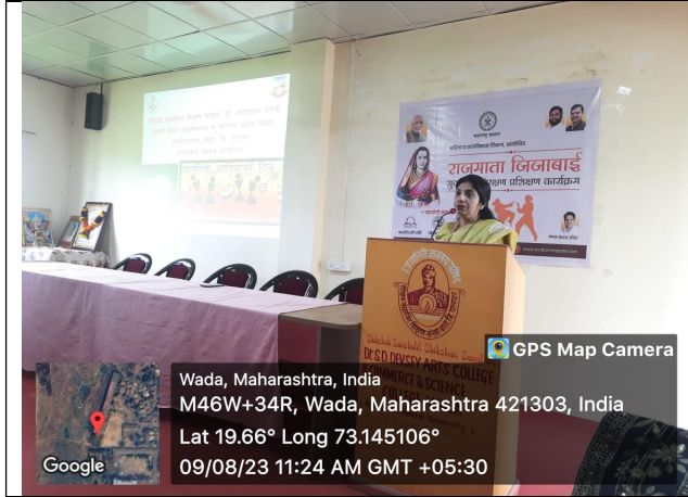
Wada, Maharashtra, India M46W+34R, Wada, Maharashtra 421303, India Lat 19.66° Long 73.145106° 09/08/23 11:24 AM GMT +05:30